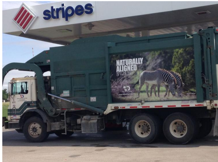
A Texas Disposal Systems trash truck. Texas Disposal is leading the charge against competitor Republic Services after Republic was chosen as the sole winner of the City of San Angelo trash contract.